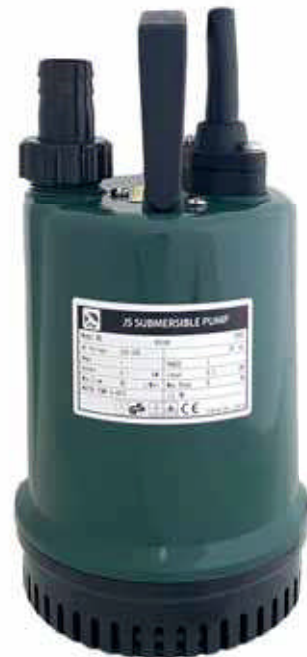
RS 100 230v