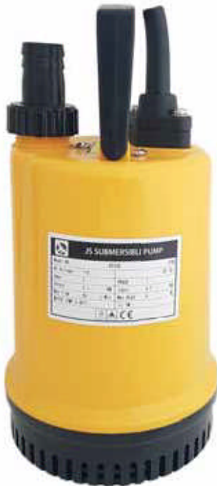
RS 100 110v